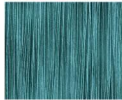
42646-3 Teal (Backing)