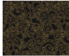
42945M-4 Black (E)