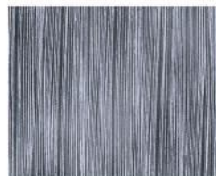
42646-2 Grey (Backing)