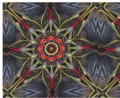
42940M-2 Grey (A)