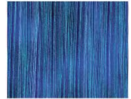
42946-1 Blue (F)