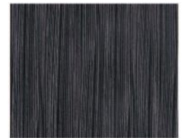
42946-4 Black (C)