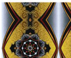
42941M-2 Grey (G)