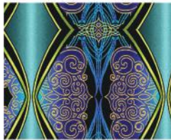
42941M-3 Teal (G)