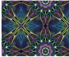
42940M-1 Blue (A)