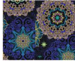
42942M-1 Blue (B)