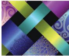
42943M-1 Blue (D)