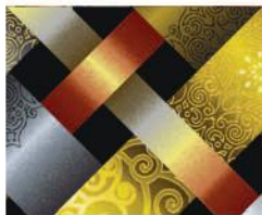
42943M-2 Grey (D)