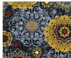
42942M-2 Grey (B)