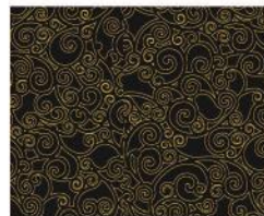
42945M-4 Black (E)