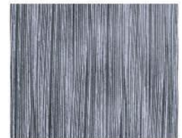
42946-2 Grey (F)