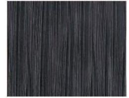
42946-4 Black (C)